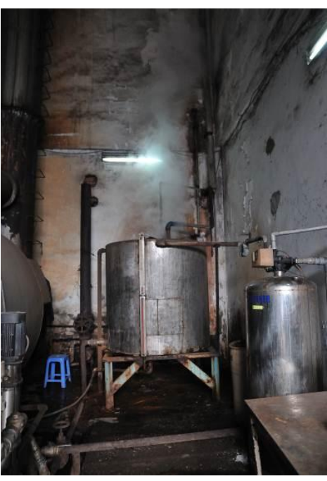
Open and no-insulation tank of condensed water

At the time of this report, Lucretia has implemented several of these solutions, including repairs to the steam and water supply system (resulting in a savings of 40 m<sup>3</sup> of water per day) and water meters, with plans to re-insulate the steam system.