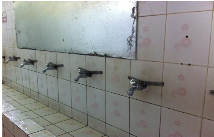
Installed automatic taps in restrooms

Though Hansae declined to implement the condensed water tank, VNCPC did proceed with applying automatic taps, timers, and improved water monitoring. These improvements resulted in a decrease of 16,000 m<sup>3</sup> of water per month, equal to $75,000USD per year.