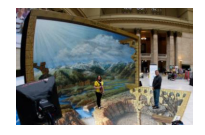
To support recruitment for Change the Course, Danone North America commissioned a life-size, interactive art installation of the Colorado River in Chicago's Union Station, where Danone employees engaged people to make the pledge.