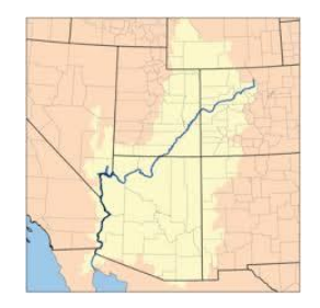
Change the Course was first piloted in the Colorado River Basin.