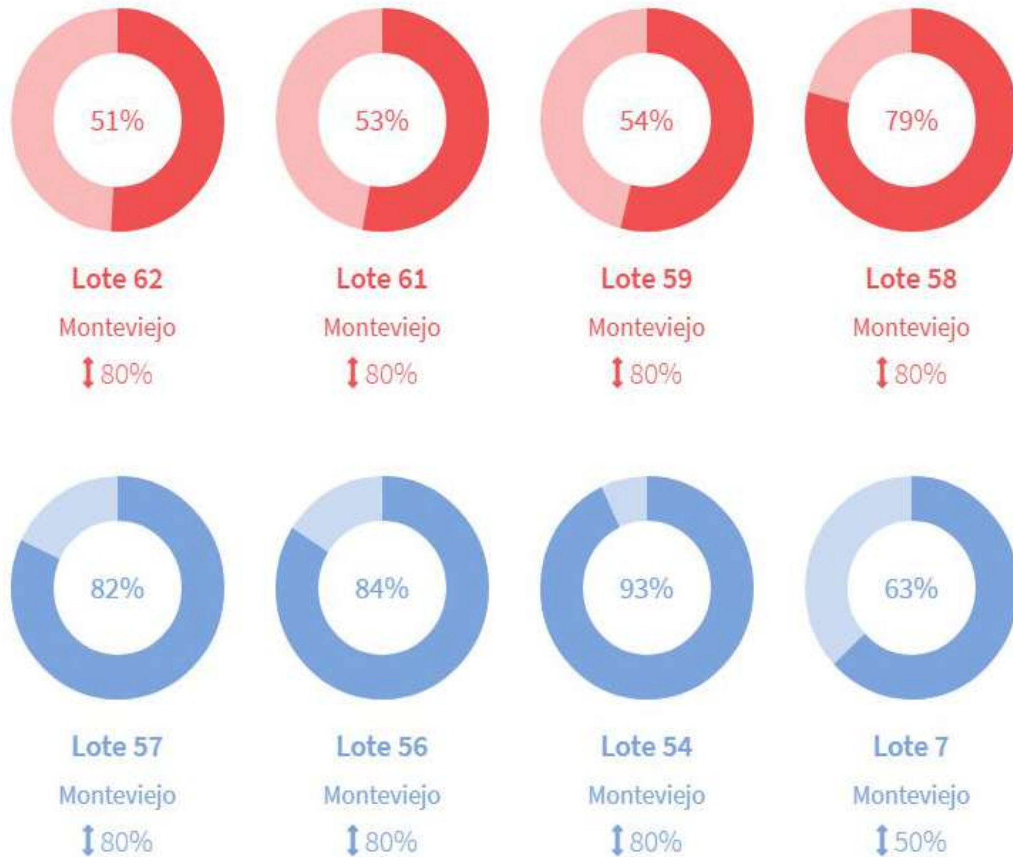
Porcentaje de Agua Útil por Lote